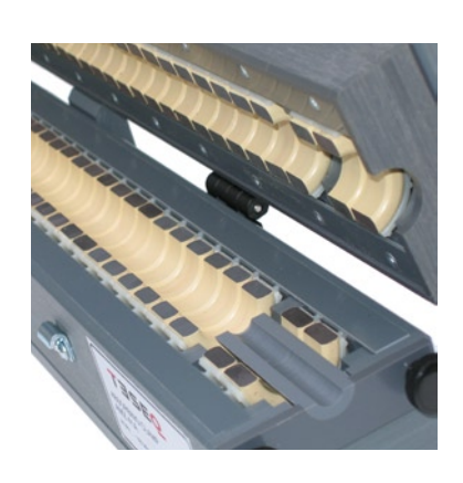
AMZ 41A, side view