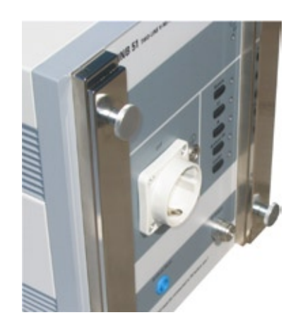
NNB 51 view on the grounding bars